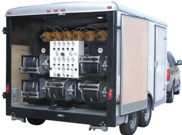
Emergency Response Trailers for Long Duration Breathing and /or Cylinder Filling Applications

Air Systems' experienced technical staff and engineering department can design a breathing air trailer with custom storage and air delivery for ANY application. Custom mobile air cylinder carts are available for industrial plant and emergency response applications.