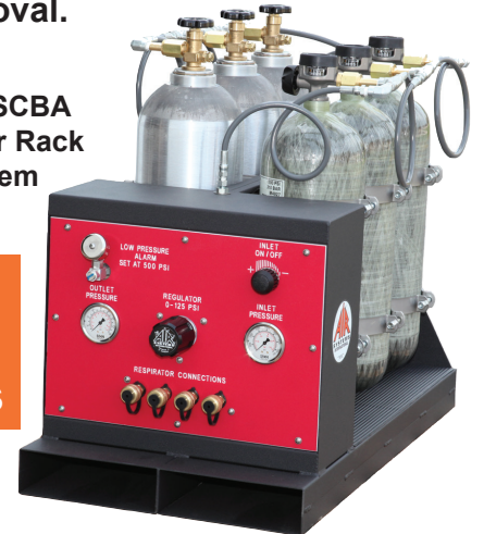
Small SCBA Cylinder Rack System

Call Customer Service for Additional Details