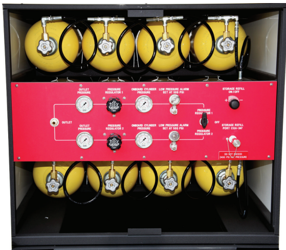
Long Duration Air Storage Hazardous Response Trailers