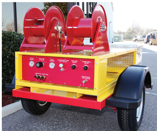
Custom Response Trailer