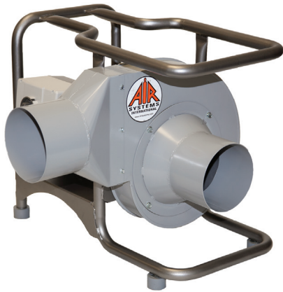
1.5 HP TEFC motor 6" Intake/Outlet